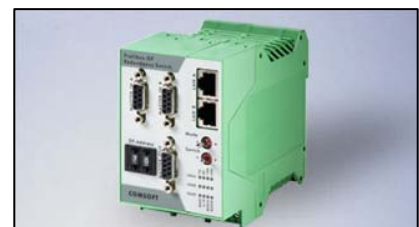
PRS – PROFIBUS DP Redundancy Switch

PRS also allows the realization of very complex redundancy systems, i.e. in connection with PROFIBUS OPC servers or overlying Ethernet based cell networks.