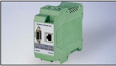
FNL – DP