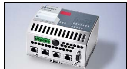
FNL Proxy PN/PB