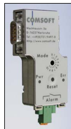
PB Diagnostic Plug

If PROFIBUS errors are detected, the potential-free alarm contact triggers a one-second impulse. Arising error messages can be quantified on a connected, superordinate control system by counting the generated impulses. It is possible to reset error messages at any time by pressing the integrated button.