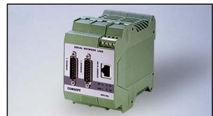
SNL2-E – Serial Network Link with Socket Interface